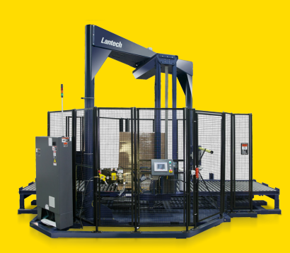
Automatic Pallet Wrappers