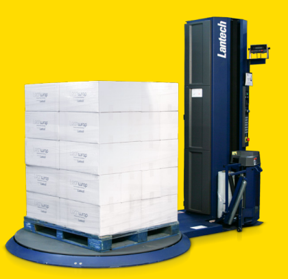
Semi-Automatic Pallet Wrappers