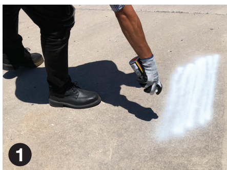
1 Apply Spot Marking Chalk Spray to desired area.

Other colours available, enquires call 13 7446 . Please note: Printed colours are indicative only.