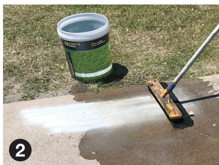
2 To remove, scrub off using water and a stiff bristled brush.