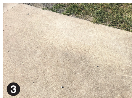
3 After scrubbing, surface is returned to original condition.